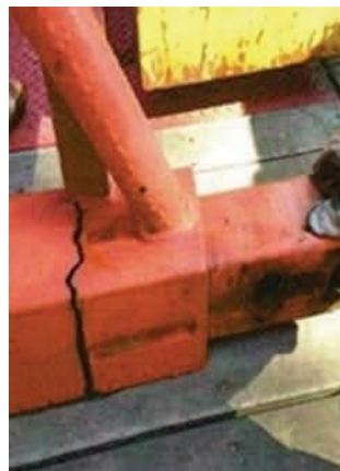
Crane in position