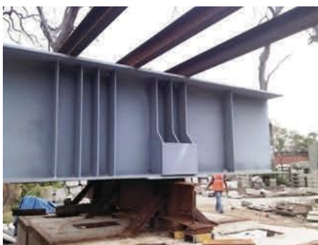
Test load setup