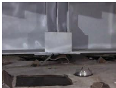
Remains of the supporting beam