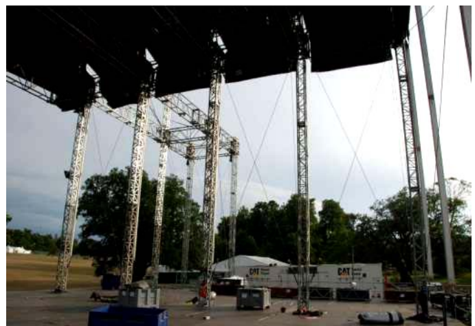
Figure 3: A braced structure

Almost all temporary stage structures are designed for an upper limit wind speed and guidance is given in Section 8 of TDS3 on how to consider wind loads including advice on operational site management. Documentation should state which of the two wind codes